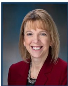
President and CEO

For me personally, 2024 was a year filled with deep gratitude—gratitude for the opportunity to serve an organization as unique and inspiring as Lakeview; gratitude for our dedicated staff who give so much of themselves to those we serve; and gratitude for the privilege, over the past 25 years, to learn from the strength and resilience of the individuals